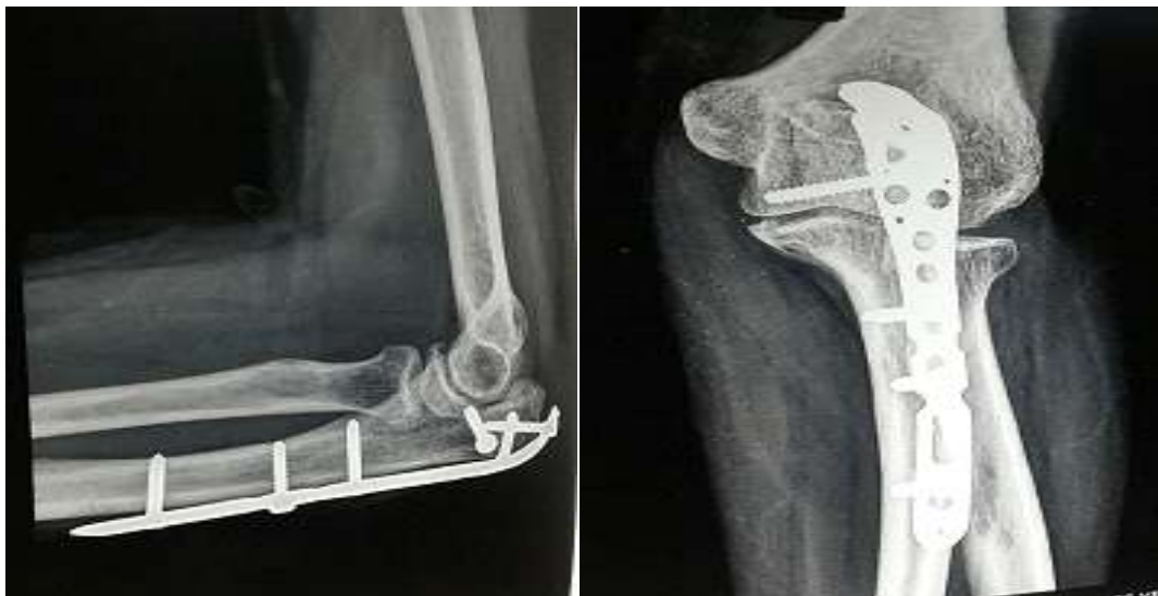
Fig-6: Post-op skiagram at 1 year.