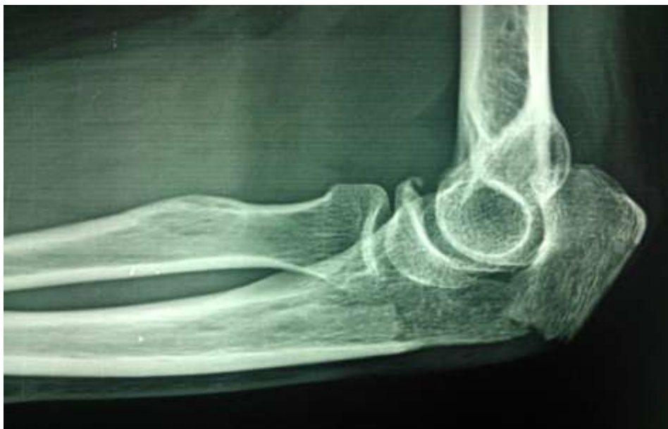
Fig-2: Pre-operative skiagram showing fracture of olecranon.