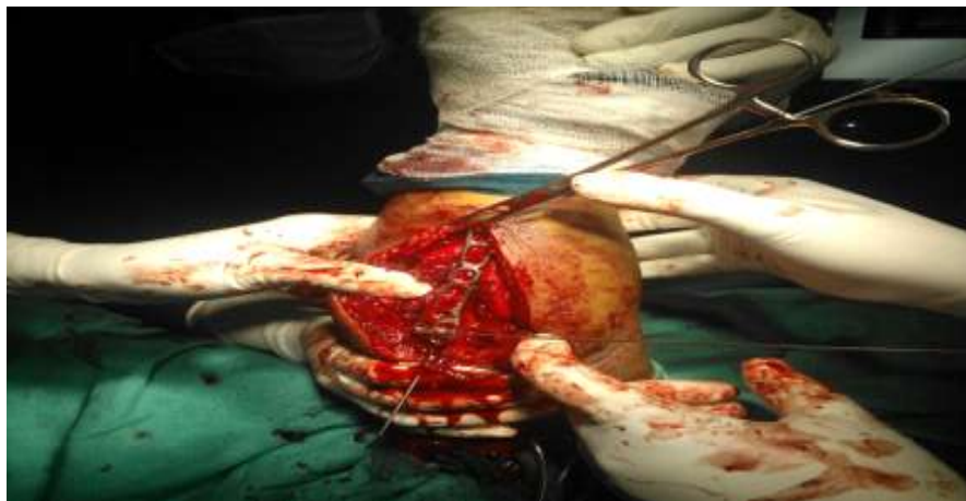
Fig-4: Provisional fixation with K-wire & precontour lock plate.