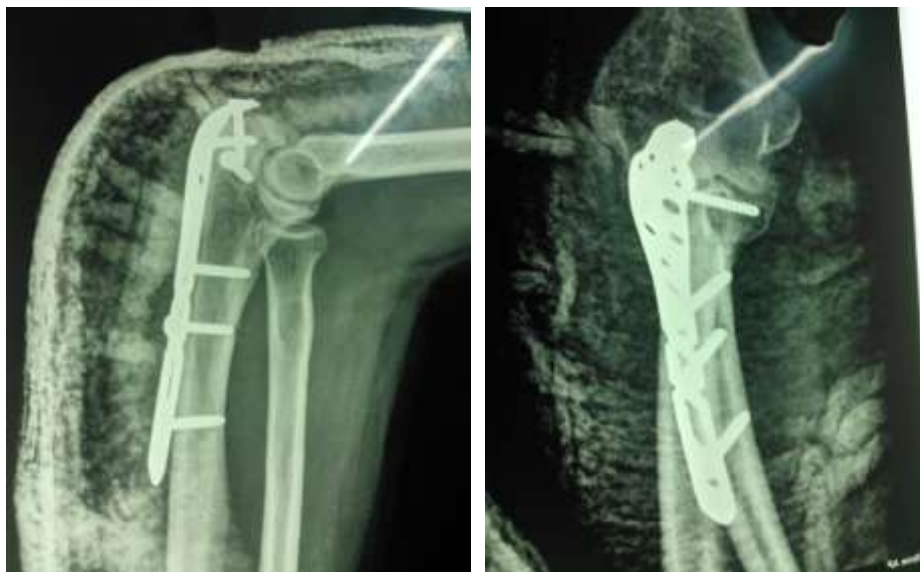
Fig-5: Immediate post-operative skiagram.