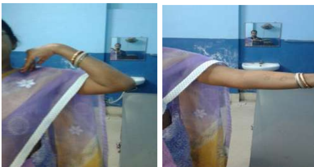
Fig-7: Post-operative clinical photo showing normal range of elbow motion.